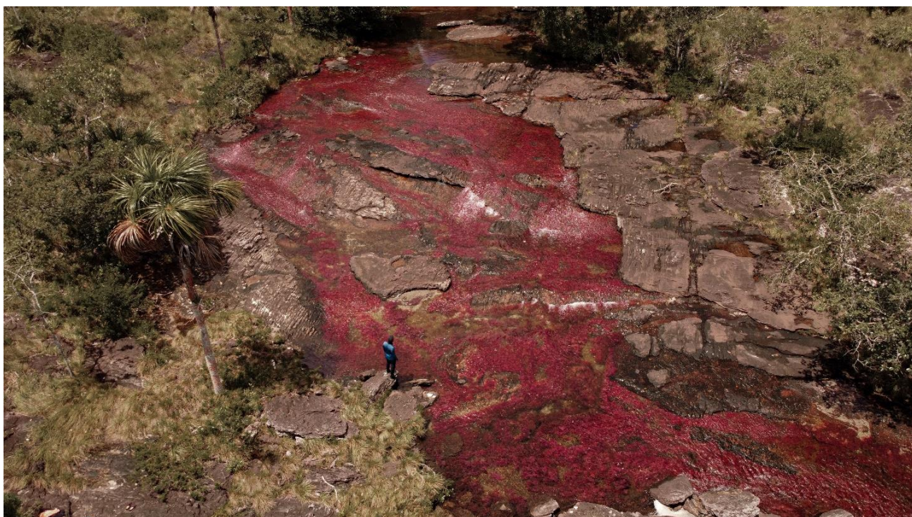
Bull corner