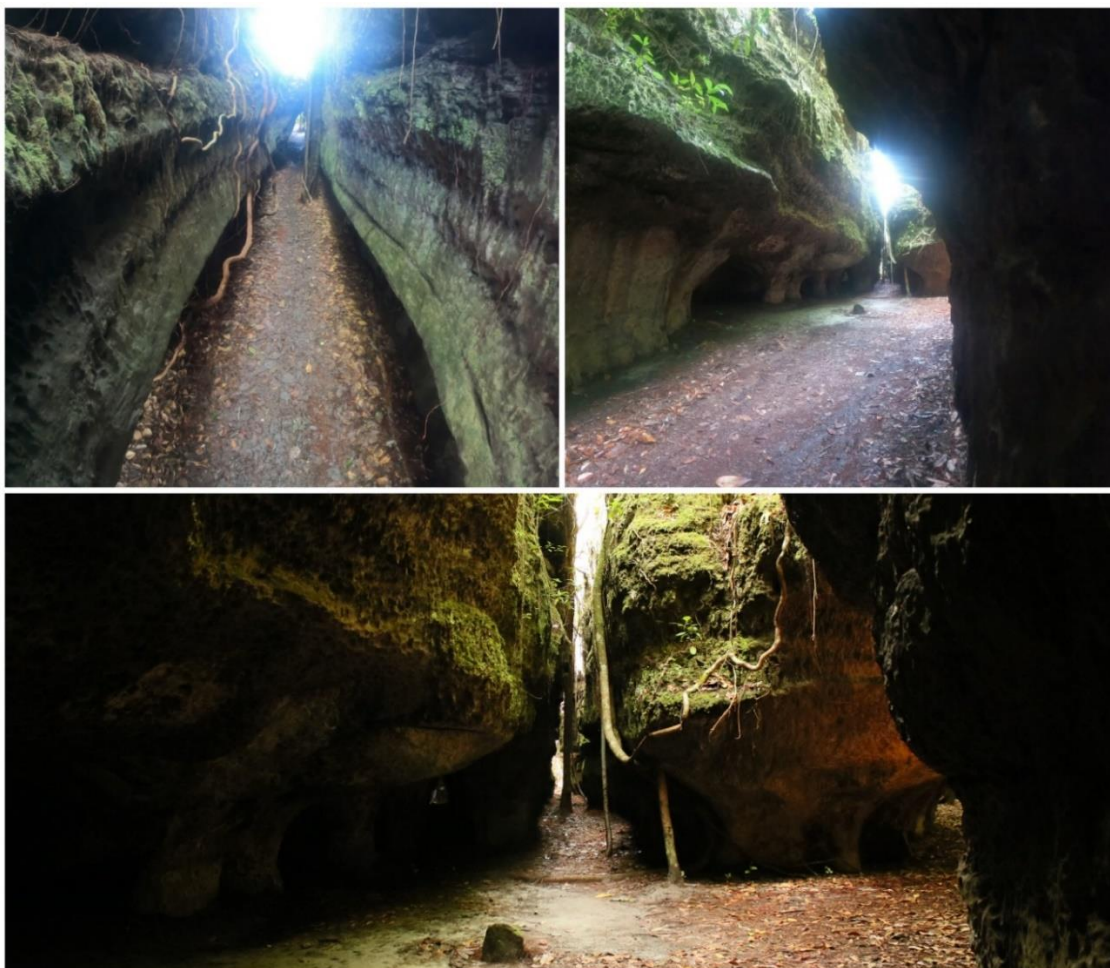
The Tunnels