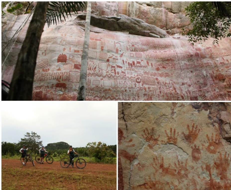
Rock art at Cerro Azul