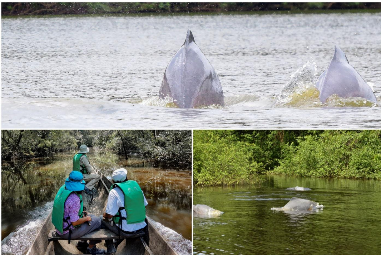
River dolphins in Damas del Nare, photos: Cesar Arredondo and Cycling-Journeys