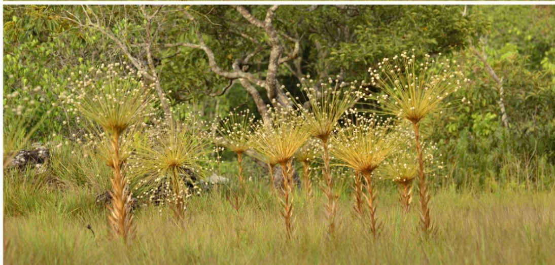
Guaviare's flower