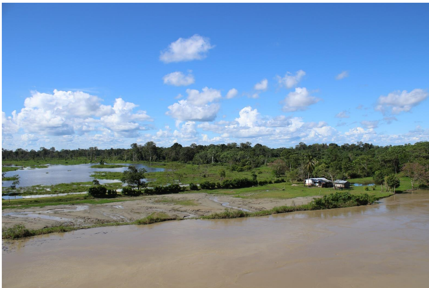
Guaviare river and flooded lands.