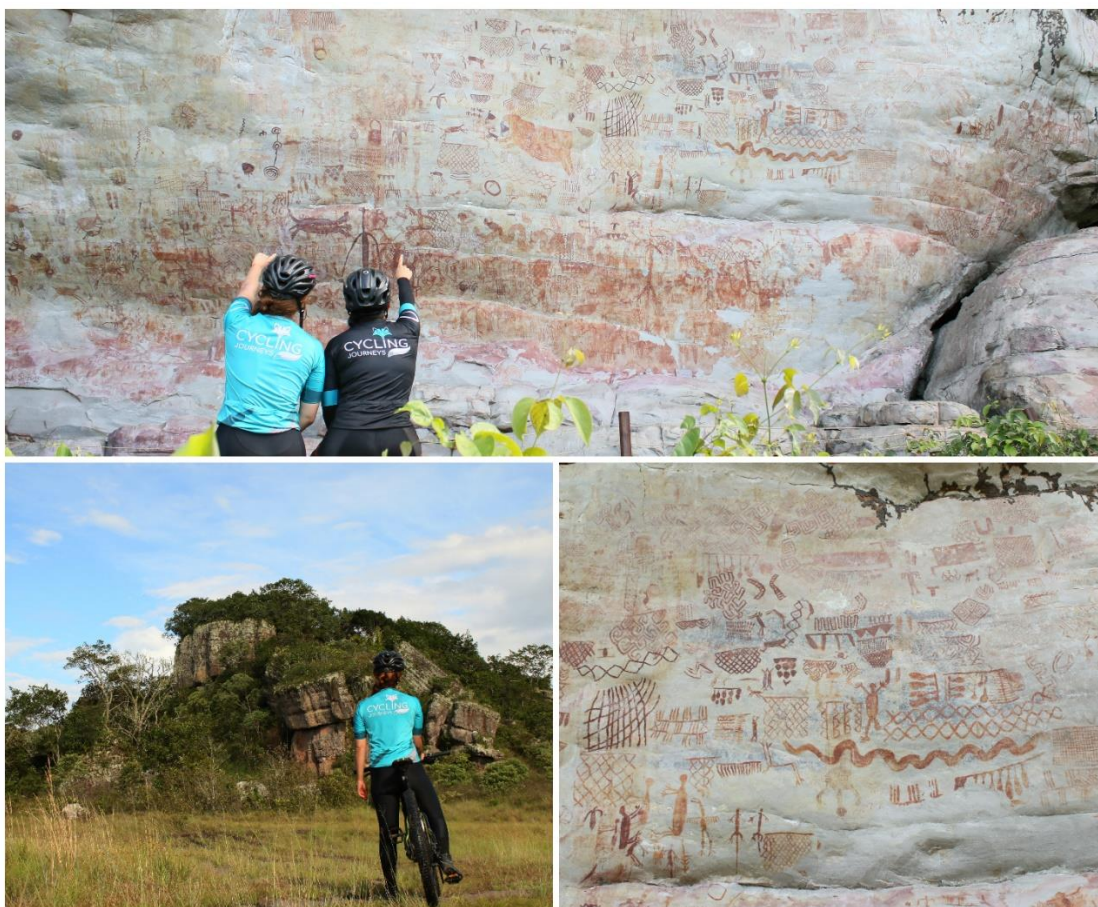
Rock art at Nuevo Tolima and the Stone city